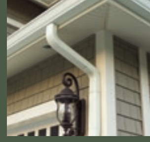
ainware, Fascia, Soffit

Variform, the Variform logo, Ashton Heights, Camden Pointe, Contractor's Choice, Heritage Cedar, Huntington Coast, Vortex Extreme, Victoria Harbor and Scenic Scapes are trademarks of Variform, Inc. Ply Gem, Leaf Relief, Leaf Logic and Leaf Smart are trademarks of Ply Gem Industries, Inc. and/or its subsidiaries. © 2014 Variform, Inc. 1109119991105/BT/CG/1013