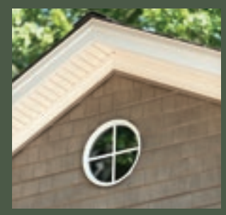
Vinyl Siding and Accent Panels

From corners to columns, guttering to soffits, door surrounds to fascia, Variform has all the details you need to define the look you want for your home. And with our enhancements — Leaf Relief<sup>®</sup> by Ply Gem gutter protection, Ply Gem Stone, Ply Gem Trim and Mouldings and Ply Gem Shutters and Accents — you'll enjoy worry-free maintenance and a beautiful finish down to the last detail.