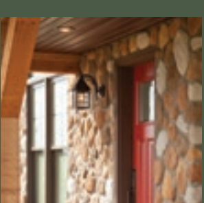
Ply Gem Stone